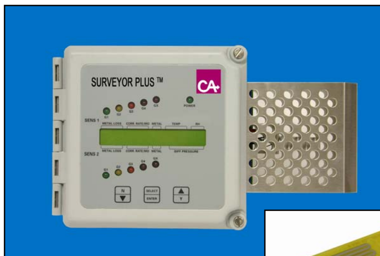
Silver & Copper Corrosion Sensors